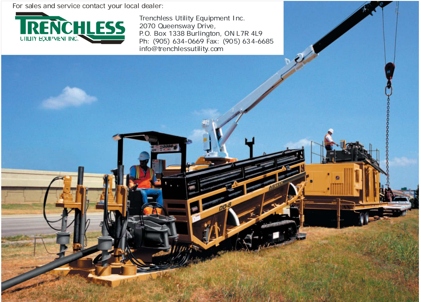
Picture shows optional equipment

Trenchless Utility Equipment Inc. 2070 Queensway Drive, P.O. Box 1338 Burlington, ON L7R 4L9 Ph: (905) 634-0669 Fax: (905) 634-6685 info@trenchlessutility.com