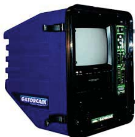
Control Box Viewed Upright

☆ The GatorCam system has a range of cable lengths (up to 120 m) that will suit most small bore pipes.