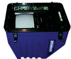
Control Box Viewed Flat

☆ The camera system can be configured for black and white , or colour .