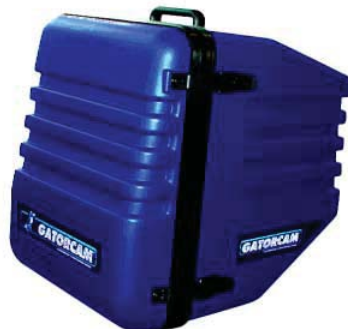
Rugged, Control Box