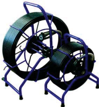
A range of cable lengths (Standard or Mini)

The Standard Cable Reel and the Mini Cable Reel both interface with a compact and portable control box. The control box allows the operator to view the image as seen by the camera. The operator can even video-tape the complete inspection process if required. The operator also has the facility to title the video-tape with address/location details and date/time information.