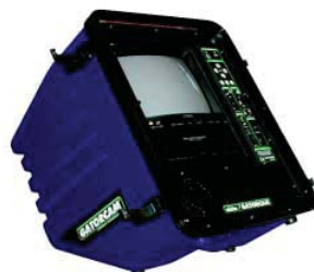
Control Box Viewed at 45°