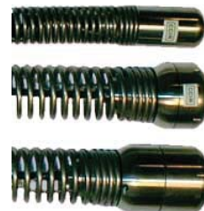
A Range of camera Heads