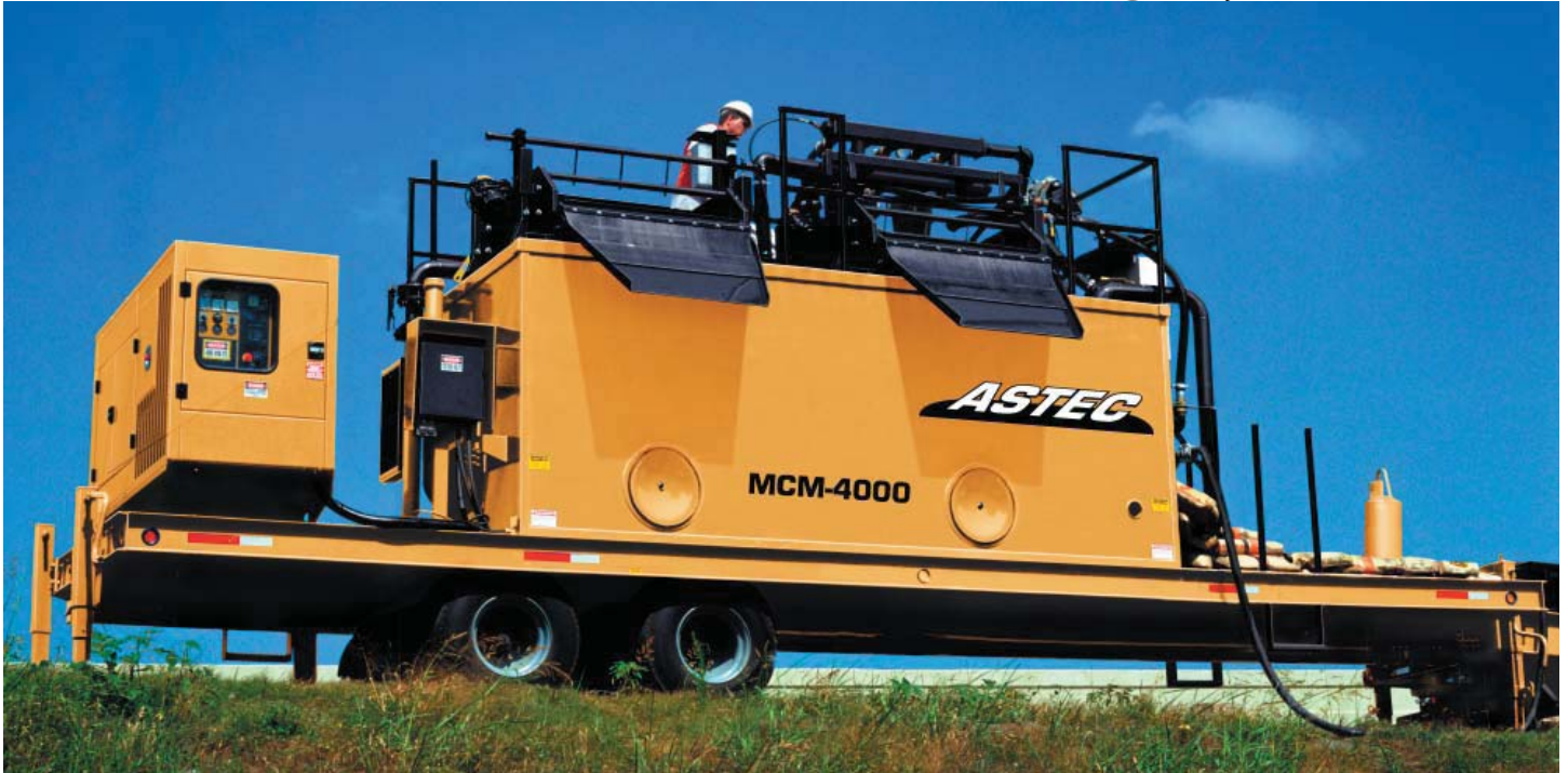
Photo shows optional equipment

Mix, clean and recycle drilling fluid in one compact, complete package!